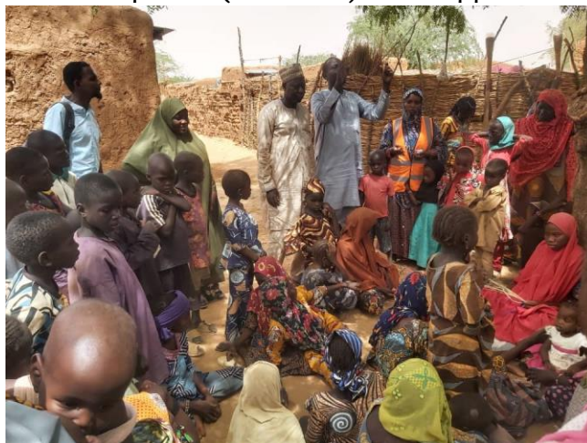
Figure 1: A picture of RAWYOD Staff & CAs during Health Outreach in Balle Community of Geidam LGA in Yobe State

Community-Oriented DMPA-SC/Self-Injection Acceleration in Nigeria (CODSAiN) Project is a program Roadmap for Women and Youth Development (RAWYOD) with support from ARFH is implemented in Yobe State, funded by the Bill and Melinda Gates Foundation (BMGF). The project aims to increase access to Hard to Reach (HTR) communities through its community-based distribution model to expand the acceptability and accessibility and close the gaps in the unmet needs and missed opportunities for FP through community scale-up of DMPA-SC and self-injection (SI) as a self-care measure within the broader contraceptive method mix.