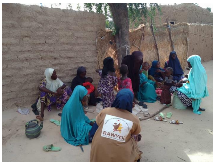
Figure 2: A Picture of RAWYOD Staff during Sensitization in Ngilewa Community in Nguru LGA, Yobe State

This project is deeply rooted in community participation and behavioural change, using an all-inclusive approach to improve primary healthcare service delivery in focus two LGAs of Yobe State (Bade and Nguru LGAs).