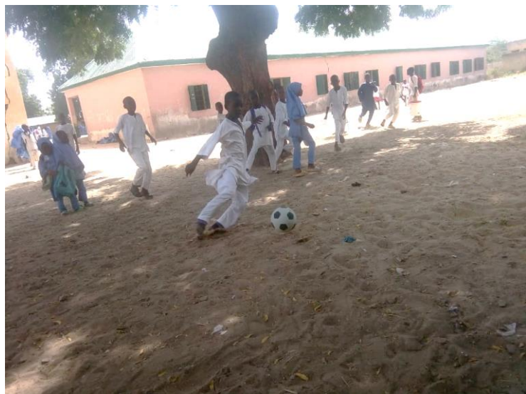
Figure 3: A picture of a project participants during a football session in Maimalari Community, Yusufari LGA, Yobe State

The Increasing access to Child Protection Services in Yobe State aims to address the critical issues faced by children at risk in conflict-affected communities across Yusufari LGA in Yobe State. It focuses on ensuring that children have access to safe, inclusive, and quality child protection services, enabling their resilience to flourish. This involves providing specialized services to support children with complex needs and assisting parents in creating a secure environment for raising their children.